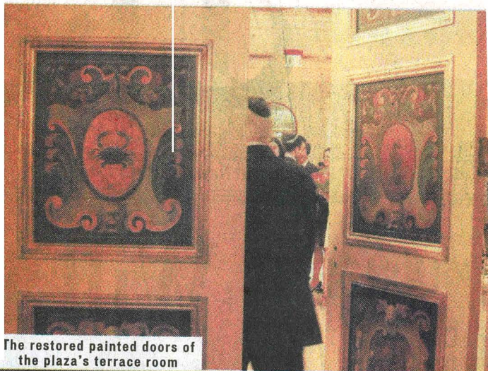
The restored painted doors of the plaza's terrace room